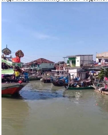
Picture 4.1 Sedekah laut Desa Tasik Agung Rembang

Translation: “This offering is a way of expressing gratitude to the sea so that the catch remains abundant every year. If it is not performed, the sea might become angry and fish will be hard to come by. For generations, the people here have believed that the sea must be protected and respected because their livelihoods depend on it. Thus, the sea offering is not merely a customary tradition but has become an integral part of the fishing community's way of life. When this event takes place, the villagers work together—from preparing the offerings and decorating the boats to organizing the festivities. This is what brings the community closer together and fosters harmony.”