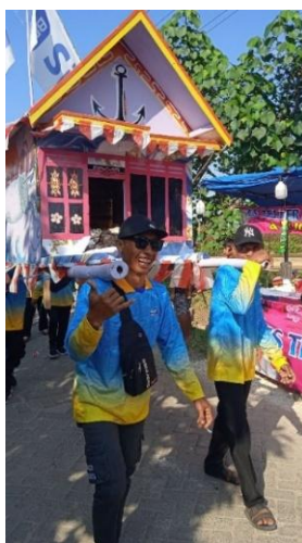
Picture 4.2 Gotong Royong Warga Desa Tasik Agung Rembang