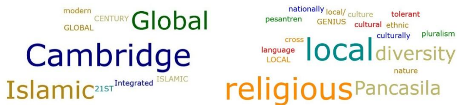
Figure 2. Visualization of the density of hybrid curriculum implementation trends in Indonesia using ATLAS.ti

A study of 18 articles on the implementation of hybrid curriculum in Indonesia, shows that education units strive to integrate international curricula that contain global contexts and national standard curricula that contain local contexts. Of the various types of international curriculum, the Cambridge curriculum is the most widely adopted international curriculum by various educational units in Indonesia. This is emphasized in figure 1 which shows the visualization of trend density, the term "Cambridge" appears most prominently in the literature studied in this study.