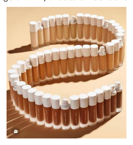
Figure 2. Fifty Shades of Foundation

The figure 2 shows fifty bottles foundation with forty caps bottle are closed and ten caps of bottles are opened. The forty closed-cap bottles mean the old edition, and the ten-opened bottles indicate the new addition of foundation shades. The forty number is