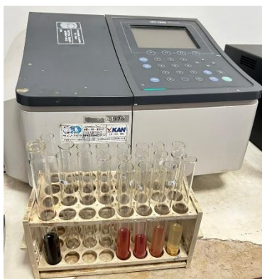
Figure 2. Analysis of polyphenol contents through spectrophotometer device

The total polyphenol test procedure used is based on the method of (Chatatikun & Chiabchalard, 2013) through UV-Visible 1800 Shimadzu equipment in Figure 2. The testing process starts with the sample being dissolved in distilled water and prepared at a concentration of 10,000 ppm. A total of 1 ml of sample was added to 2 ml of distilled water. Then 1 ml of 10% Folin solution and 1 ml of bicarbonate solution (60 g/L) were added. The sample was then incubated for 60 minutes at room temperature. The absorbance was read on a spectrophotometer at a wavelength of 725 nm. Gallic acid standards were prepared by dissolving gallic acid in distilled water and were prepared at concentrations of 100, 250, 500, and 1000 g/ml. Distilled water was also used as a blank. The standards and blanks were analyzed in the same way as the samples. Total polyphenols were calibrated against the gallic acid standard and expressed as mg gallic acid equivalent (G.A.E.) g -1 D.W. Gallic acid was used as a standard because gallic acid is a type of natural antioxidant that is very stable (Rahayu & Inanda, 2015).